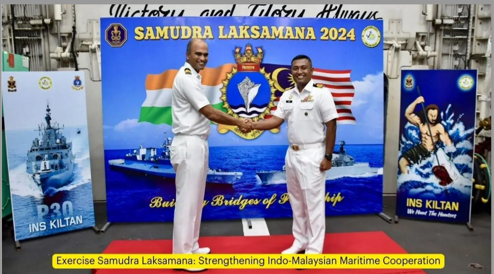
Exercise Samudra Laksamana: Strengthening Indo-Malaysian Maritime Cooperation